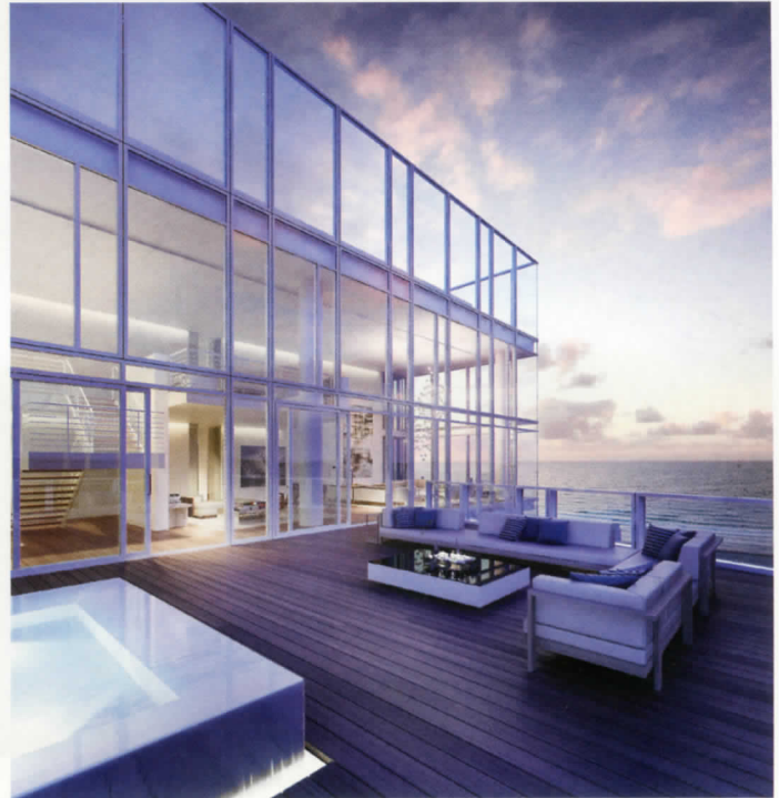
Main image (left): One Thousand Museum. Above: The Surf Club. Below: Ritz-Carlton Residences.

Another star architect, Richard Meier, has taken on redevelopment of Miami's private members social club The Surf Club, founded in 1929 by Harvey Firestone. Elizabeth Taylor, Frank Sinatra and the Duke and Duchess of Windsor would saunter through the grounds, while Sir Winston Churchill enjoyed painting seascapes from one of the beach cabanas. Meier's two new residential buildings flank the original club. Each block houses 157 properties, 30 of which are hotel residences,