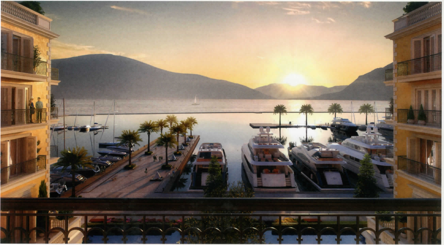
Above: The Regent Residences Porto Montenegro. Below: Portonovi and Luštica Bay.