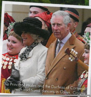
The Prince of Wales and the Duchess of Cornwall with traditional dancers in Osijek, Croatia